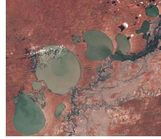
Figure 2: The presence of blackwater at Menindee Lakes continues to be seen via Satellite image taken on 1 March 2022

Further information is available at <a href="https://www.mdba.gov.au/issues-murray-darling-basin/blackwater">https://www.mdba.gov.au/issues-murray-darling-basin/blackwater</a>